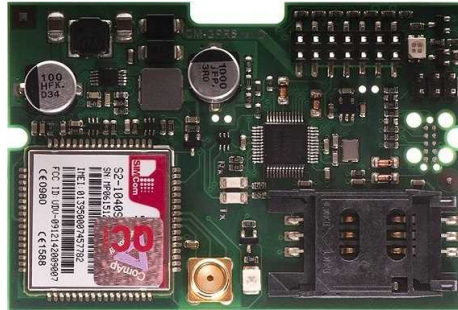
Image 1.1 CM-GPRS module

CM-GPRS plug-in module is a GSM/GPRS modem which can work in two modes of operation based on the settings in the setpoint Mode.